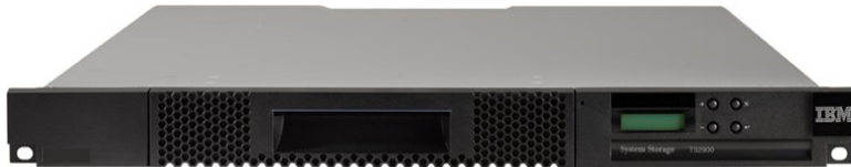
Figure 1. TS2900 Tape Autoloader

The TS2900 Tape Autoloader is shown in the following figure.