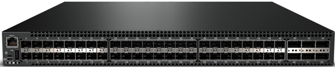
Figure 1. Lenovo RackSwitch G8272

The RackSwitch G8272 is shown in the following figure.