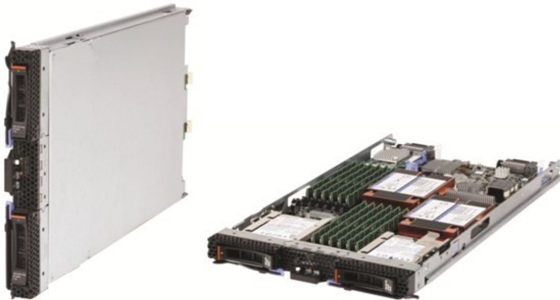
Figure 1. IBM BladeCenter HS23E