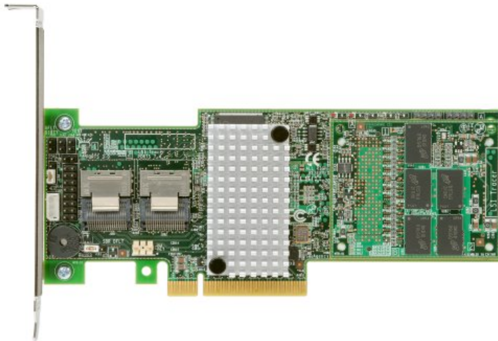
Figure 1. ServeRAID M5110 SAS/SATA Controller (with optional cache installed)

These products are optimized to deliver the performance that is demanded by the ever-growing I/O requirements of today's enterprises. While M5110 comes as a small form factor PCIe adapter, M5110e comes integrated with the System x3650 M4 and x3750 M4 (8722) servers. These adapters also share a common set of upgrades, simplifying inventory management.