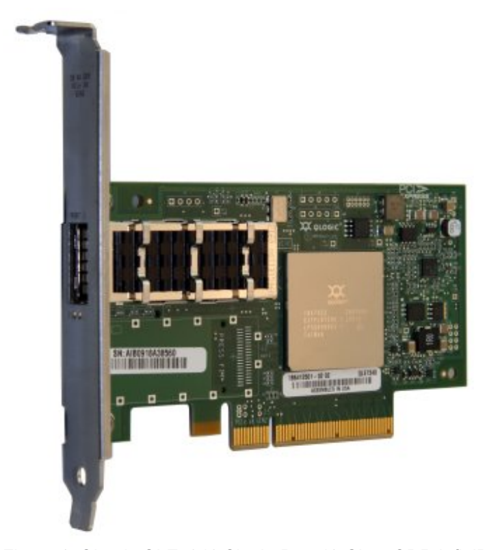
Figure 1. QLogic QLE7340 Single-Port 40 Gbps QDR InfiniBand HCA

Figure 1 shows the QLogic QLE7340 single-port 4X QDR IB PCIe 2.0 X8 host channel adapter.