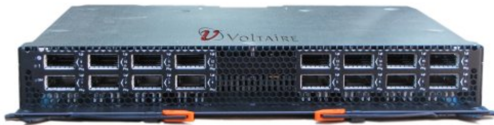
Figure 1. Voltaire 40 Gb InfiniBand Switch Module for BladeCenter