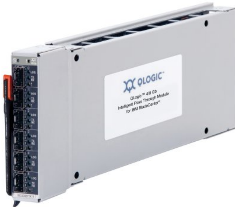
Figure 1. QLogic 4/8 Gb Intelligent Pass-thru Module for BladeCenter

Figure 1 shows the QLogic 4/8 Gb Intelligent Pass-thru Module. The 8 Gb module has an identical port configuration.