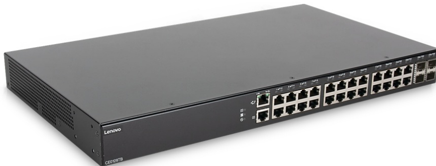
Figure 1. Lenovo CE0128TB Switch

The Lenovo CE0128TB Switch is shown in the following figure.