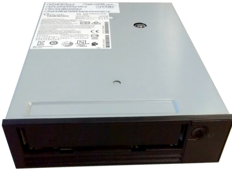
Figure 1. ThinkSystem Internal Half High LTO Gen8 SAS Tape Drive

Figure 1 shows the ThinkSystem Internal Half High LTO Gen8 SAS Tape Drive.