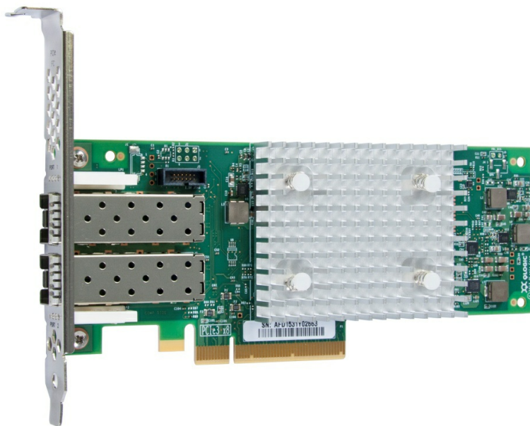
Figure 1. ThinkSystem QLogic QLE2742 PCIe 32Gb 2-Port SFP+ Fibre Channel Adapter (shown without the included 32 Gb transceivers)

The QLogic QLE2742 2-port 32 Gb Fibre Channel HBA is shown in the following figure.