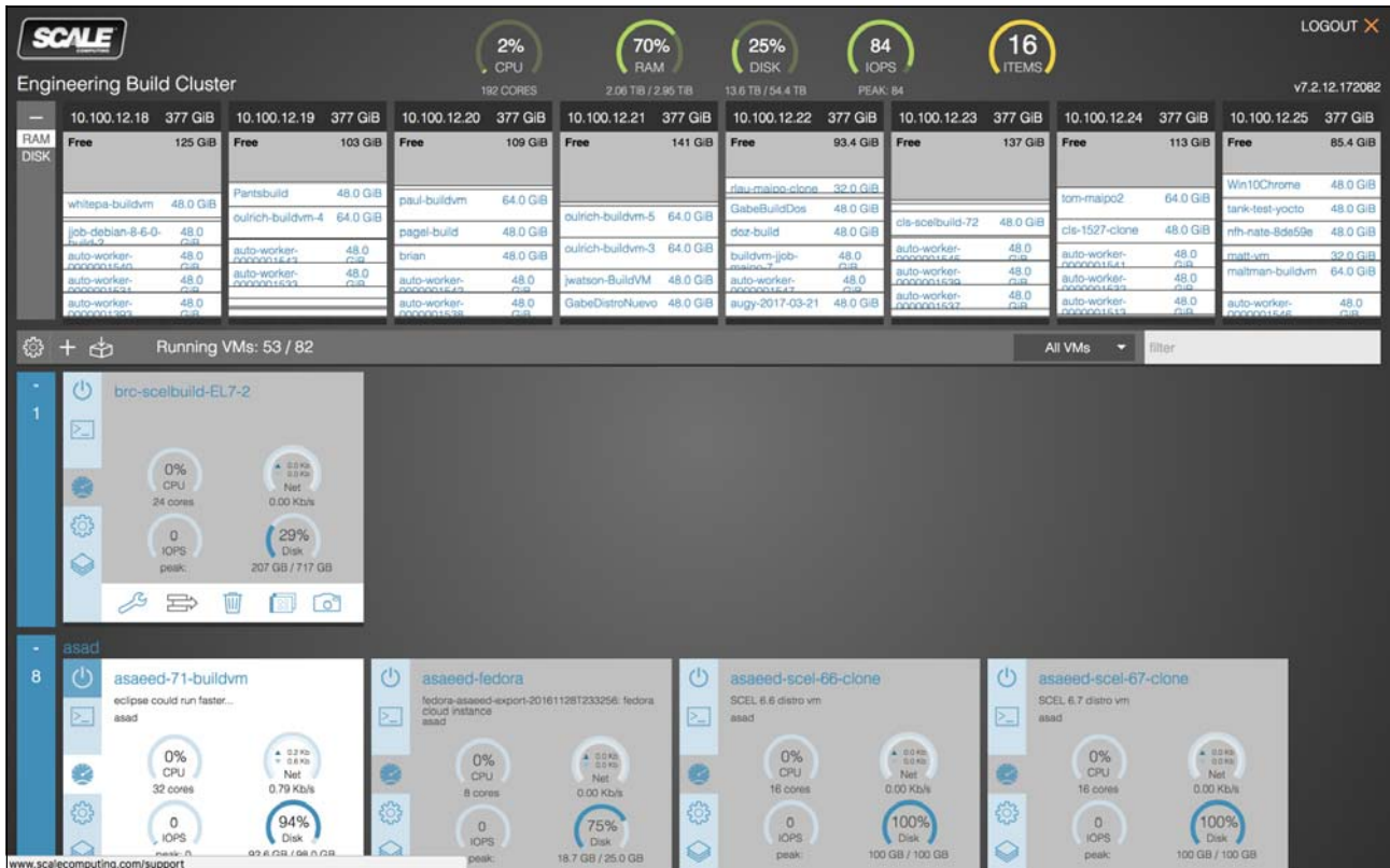
Figure 2 HC3 Web Interface

Figure 2 shows an example of the web interface.