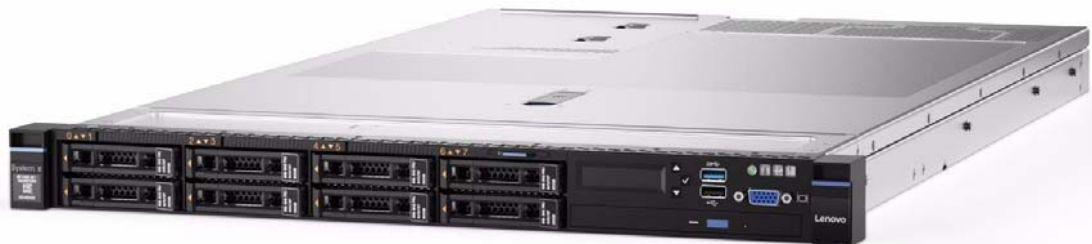
Figure 5 Lenovo System x3550 M5

The versatile 1U two-socket Lenovo System x3550 M5 rack server fuels almost any workload from infrastructure to Big Data with industry-leading reliability. It comes integrated with up to two Intel Xeon processors E5-2600 v4 series (44 cores per system), faster, energy-efficient TruDDR4 Memory, and up to 12 drives of storage.