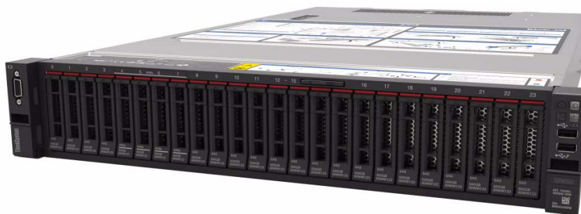
Figure 4 Lenovo ThinkSystem SR650

The SR650 server is designed to handle a wide range of workloads, such as databases, virtualization and cloud computing, virtual desktop infrastructure (VDI), enterprise applications, collaboration/email, and business analytics and big data.