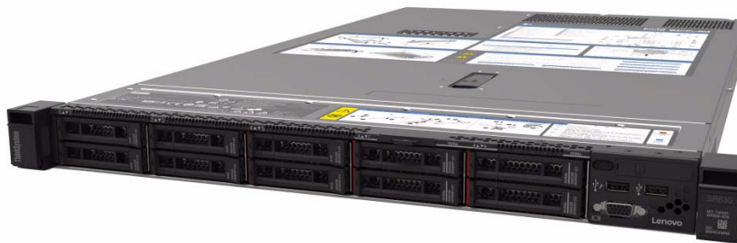
Figure 3 Lenovo ThinkSystem SR630

The SR630 server is designed to handle a wide range of workloads, such as databases, virtualization and cloud computing, virtual desktop infrastructure (VDI), infrastructure security, systems management, enterprise applications, collaboration/email, streaming media, web, and HPC.