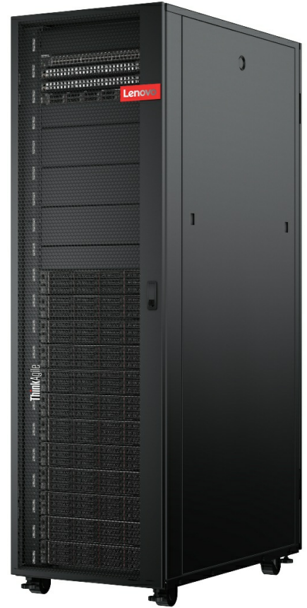
Cloud-optimized ThinkSystem SR650 servers, factory-installed in a rack with Lenovo RackSwitch networking, form the foundation of the Lenovo ThinkAgile SX for Microsoft Azure Stack solution.

With co-located engineering organizations and a history of technical collaboration, Microsoft and Lenovo consistently deliver innovative joint solutions for the data center. Lenovo's leadership in reliability, customer satisfaction, and performance—combined with Microsoft's leadership in software and cloud services—continues to deliver innovative data center solutions and lower TCO for our joint customers.