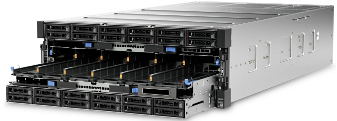
Upper and lower compute trays slide out the front of the chassis for easy upgrades and serviceability

The ability to scale up your systems is a requirement that has been more easily said than done. The unique modular design of SR950 redefines scalability by putting everything within reach.